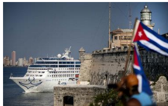
Why a New Orleans-Cuba cruise could soon become reality (again) A measure allowing Americans to travel freely to Cuba has won U.S. Senate approval.

President-elect Donald Trump threatened during the campaign to revert to more restrictions on travel and trade with Cuba. He said he would undo Obama's warming of the U.S.-Cuba relationship.