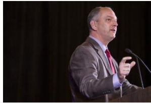
Louisiana, Cuba commit to trading more -- if embargo is lifted The governor is visiting Cuba all week.