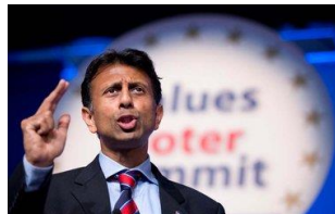
Bobby Jindal spends $73,000 in taxpayer funds on state police protection in Europe

"We believe Louisiana is the only U.S. state to succeed in arranging meetings with all of the top Cuban government ministries for which we requested an audience," Pierson said.