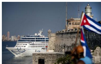
Why a New Orleans-Cuba cruise could soon become reality (again) A measure allowing Americans to travel freely to Cuba has won U.S. Senate approval.

President-elect Donald Trump threatened during the campaign to revert to more restrictions on travel and trade with Cuba. He said he would undo Obama's warming of the U.S.-Cuba relationship.