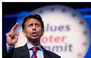
Bobby Jindal spends $73,000 in taxpayer funds on state police protection in Europe

"We believe Louisiana is the only U.S. state to succeed in arranging meetings with all of the top Cuban government ministries for which we requested an audience," Pierson said.