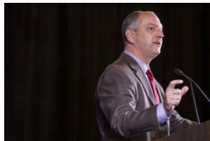
Louisiana, Cuba commit to trading more -- if embargo is lifted The governor is visiting Cuba all week.