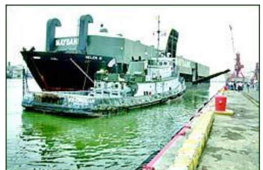
An American barge from Mobile, Ala. brings newsprint and timber to Havana in July. It was the first U.S.-crewed commercial vessel in Cuba since 1961.

In the two years since American farmers have been permitted to sell to Cuba, the countries' trade relationship has lurched forward in fits and starts.