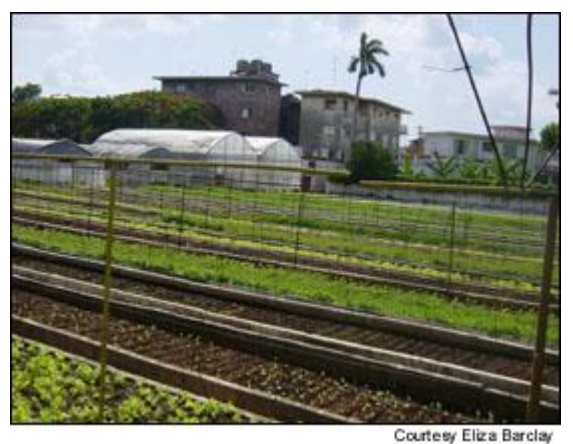
This award-winning organoponico is on Quinta Avenida in the Miramar neighborhood of Havana. The garden provides cilantro, several varieties of lettuce, medicinal herbs, and bok choi to neighbors and to a school two blocks away.

In the early 1990s, the average Cuban dinner table did not boast a spread even remotely close to the bounty enjoyed by many today. During these years, when foreign economic support disappeared with the collapse of the Soviet Union, average caloric and protein intake dropped to nearly 30 percent below 1980s levels.