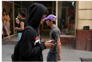
Jovem em Havana tenta se conectar no primeiro dia de venda de pacotes de internet para celular

Os anúncios feitos nos últimos dias pelo regime cubano estão mais para “fake changes” (mudanças falsas) do que representam, de fato, uma guinada na condução econômica da ilha e um aceno a uma Cuba menos avessa ao capitalismo.