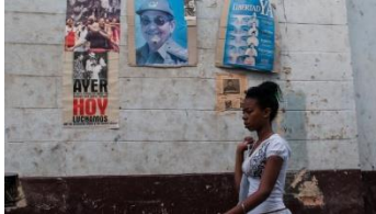
Raul Castro's face stares down from a wall in Havana. Most Cubans have never known anything but the rule of the Castros