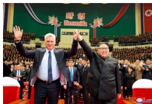
Miguel Díaz-Canel and Kim Jong Un during a visit by the Cuban leader to North Korea in November 2018.

North Korean leader Kim Jong Un rolled out the red carpet and staged massive parades through Pyongyang streets for his visitor like the ones once staged for the late Fidel Castro. And Russia’s Vladimir Putin joined him in a news conference during which they criticized President Donald Trump.