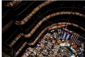
A Cuban and an American flag hang in the atrium on the Carnival Paradise on June 29, 2017 at Port of Tampa during the inaugural Carnival Cruise from Tampa to Havana.