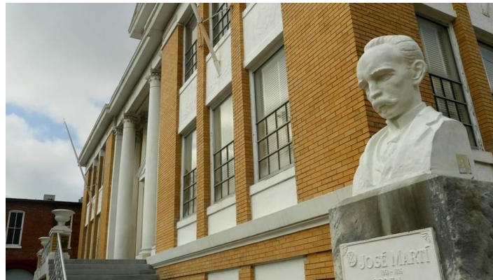
A statue of Jose Marti, considered the George Washington of Cuba, adorns the entrance to the historic Cuban Club, 2010 14th Ave in Ybor City. The club's $190,000 loan for renovation work was frozen by financial institutions seeking assurances it isn't doing business with Cuba.

Cuban Club in Ybor City tries to convince financiers it does no business in Cuba