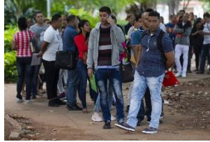
Cubans wait outside of the Panamanian Embassy in Havana to apply for tourist cards that would give them the right to travel and shop in Panama for 30 days.

For most Cubans, a trip to Panama is an expensive proposition once airfare, lodging, food, taxis and a 7 percent Panamanian Value Added Tax are tallied with the price of their purchases.