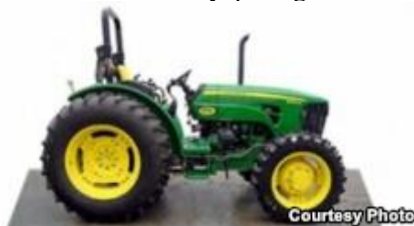
El fabricante de maquinaria agrícola estadounidense John Deere está vendiendo a Cuba tractores de su serie 5000 (75-115 HP).

En estos rubros las importaciones cubanas cayeron de $ 6 millones 121.425 en 2016 a $ 4 millones 835,222 hasta noviembre de 2017. Los envíos incluyeron medicamentos como penicilina e insulina, pasta dental, utensilios de laboratorio, equipos electrónicos médicos y quirúrgicos, suministros oftalmológicos y cánulas.