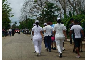
Nurses head toward the crash of a passenger plane carrying 104 passengers and several Mexican crew members that went down in a field shortly after taking off from Jose Marti International Airport in Havana.

The flight to Holguín took off shortly after noon and crashed at 12:08 p.m, according to Granma. Witnesses said the plane turned around to head back to the airport and struck electric cables before plummeting. Rescuers arrived within 12 minutes of the crash, according to a Granma reporter.