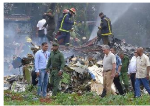
Cuban president Miguel Díaz-Canel at the site of the plane crash. Shortly after departing José Martí International Airport in Havana, a Boeing 737-200 crashed in a suburb of the capital city on May 18.

"The news is not very hopeful. It seems there will be a high number of victims," he said. In a Granma photo, he is seen in shirt sleeves striding through a field near the charred body of the plane.