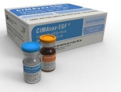
CIMAvax, a lung cancer vaccine developed in Cuba, is being administered to U.S. patients during a clinical trial at Roswell Park Comprehensive Cancer Center. Roswell Park

The recent announcement of the new joint venture came a day after a Roswell Park presentation of the results of its phase I clinical trial of CIMAvax during the International Association for the Study of Lung Cancer’s 19th World Conference on Lung Cancer in Toronto.