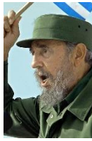
Fidel Castro rouses crowds of supporters in 2002. He died in 2016 aged 90

Mr Diaz-Canel has dabbled anecdotally in progressivism, in 2013 citing the internet — heavily restricted in Cuba — as a constructive social tool and endorsing student bloggers' freedom of expression. He backs gay rights and embraced economic reforms introduced by Raul Castro that permitted private entrepreneurship, until they were shut down again. But he has also spoken longer and louder about cracking down on private enterprise, crushing dissidents and throttling the development of independent media, presenting a contradictory image.