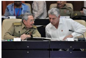
Raul Castro, 86, is handing over to Miguel Diaz-Canel, 57, who has appeared to encourage social liberalism while talking tough on crushing dissidents