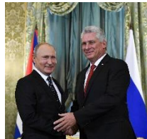
Russian President Vladimir Putin, left, and Cuban President Miguel Diaz-Canel, greet each other during their meeting in the Kremlin in Moscow, Russia, Friday, Nov. 2, 2018.