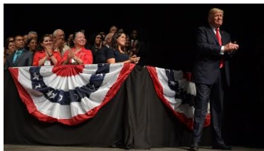
Trump en el acto celebrado en Teatro Manuel Artime de Miami el 16 de junio de 2017 donde anunció la nueva política de EE.UU. hacia Cuba.