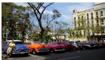
Restored 1950s cars stand idle as tourist numbers dwindle